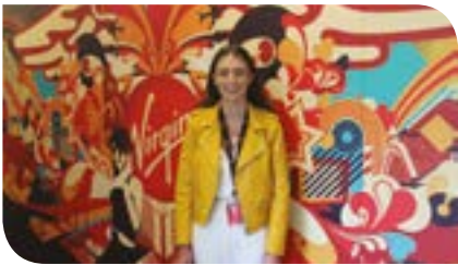
Ahead of the 2016 Festival of Design & Technology, the Vice-Chancellor visited graduates now working at bespoke exhibition