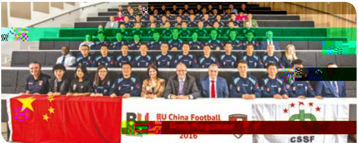
60 coaches from different countries and coaches across China participated in the BU China Football Summer Programme, a new initiative in collaboration with partner AFC Borneo.

For a year after the devastating 2015 earthquake in Nepal, students from BU, along with students from India and Nepal, were mobilized in a new broadcast in Kathmandu, reporting on the disaster aftermath. Their aim was to change radiological journalism by capturing the voice of Nepalese people at the disaster site, recover and life after the earthquake.